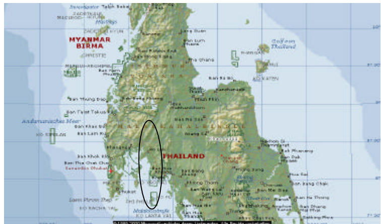
Areas with ECOM activities