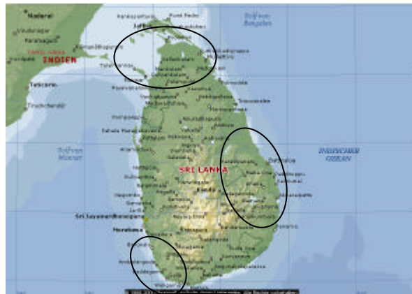
Areas with ECOM assessment